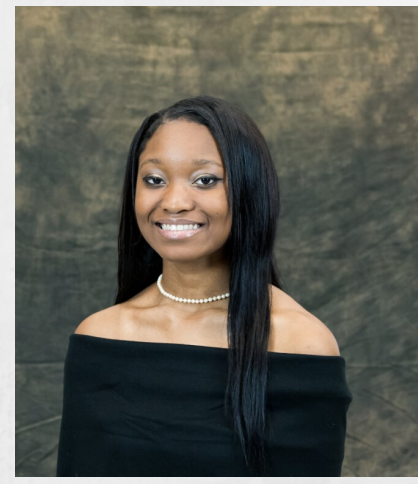
IT'S SHS WHERE WE EXPECT SUCCESS AND NOTHING LESS!